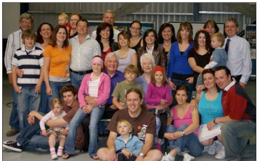
30 members of the Westcott Clan