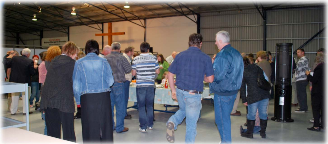
Fellowship at Mamre – Following our Men's Camp!

MAKE SURE YOU LOCK THE CAMP DATES INTO YOUR DIARY – 27 th Sept to 2 nd Oct